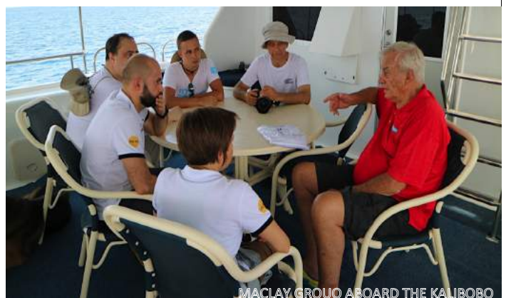
MACLAY GROUP ABOARD THE KALIBOBO

The organisation of the visit of the Maclay Foundation was done for the purpose of creating a better understanding of the work undertaken by Maclay. The Melanesian Foundation facilitated the visit on a non commercial & non political basis.