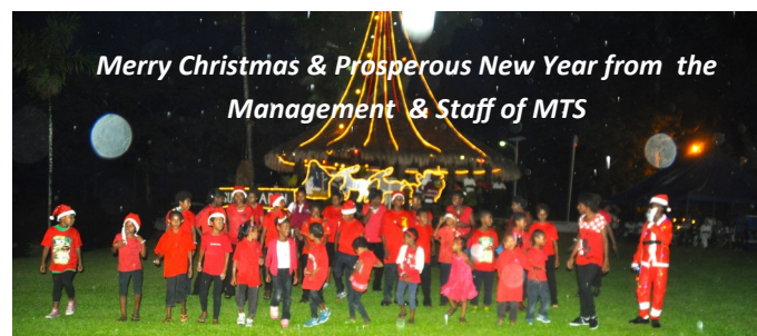
Merry Christmas & Prosperous New Year from the Management & Staff of MTS