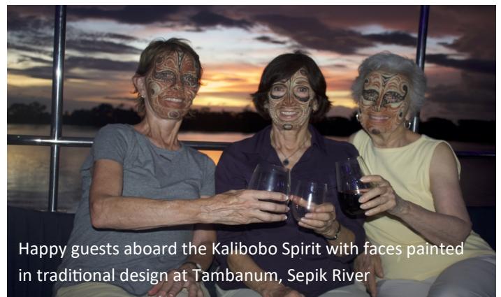
Happy guests aboard the Kalibobo Spirit with faces painted in traditional design at Tambanum, Sepik River

In 2019 MTS is planning several more expeditions along the Sepik River some of which coincide with various festivals and cultural shows in Mt Hagen, Goroka and Madang. The dates of these cruises are shown below and as space is limited to 12, it is wise to book as early as possible.