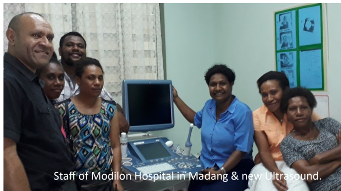
Staff of Modilon Hospital in Madang & new Ultrasound.