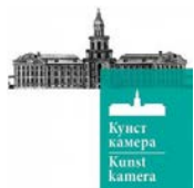
Peter the Great Museum of Anthropology and Ethnography (the Kunstkamera) of the Russian Academy of Sciences