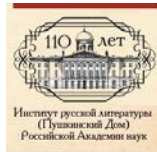
The Institute of Russian Literature (the Pushkin House) of the Russian Academy of Sciences