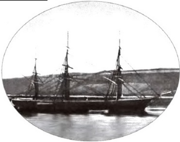
Corvette Vityaz, which brought N.N. Miklouho-Maclay to the coast of New Guinea Island.